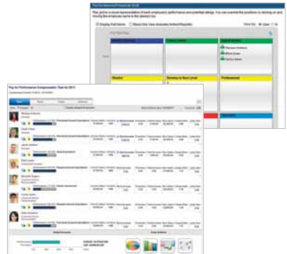
Calibrate and motivate your teams using easy-to-understand tools.