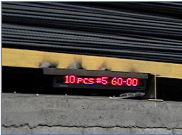
aSa's console does more than control the shearline. It provides a thorough production plan for the entire shop crew. For example, a message board connected to the console tells the shake-out person what stock is required next.